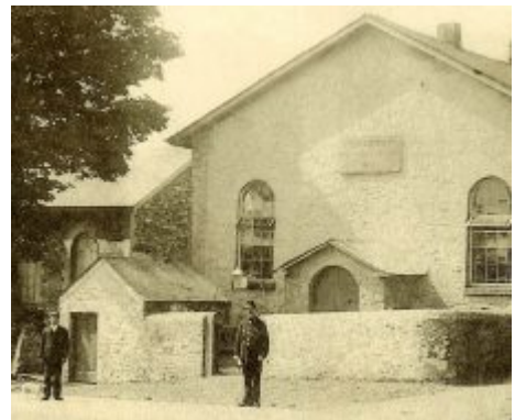
Early images of the Methodist Chapel

Breakfast at Cafe Church , monthly on Sundays, 9 Feb, 8 Mar, 9.30am.